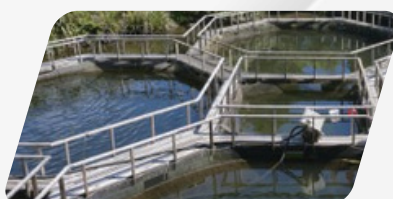
Fish pond drainage and irrigation